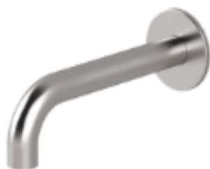
Immagine Prodotto - Product Image

Настенный излив для ванны AISI316L 19cm Ø25mm для прямого монтажа на стену, соединение G1/2" M