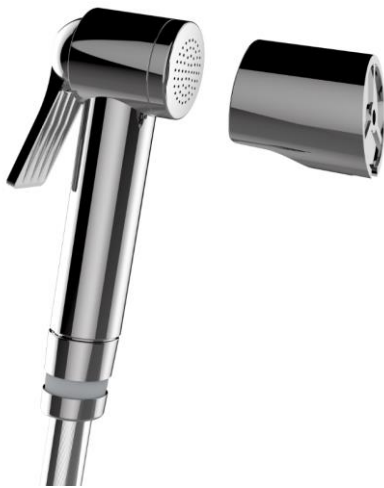
Immagine Prodotto - Product Image

Комплект: гигиенический душ с кнопкой APICE из АБС-пластика (61 отверстие). Держатель для душа. Шланг Cromolux 125 см.